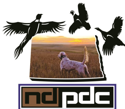
North Dakota Pointing Dog Club